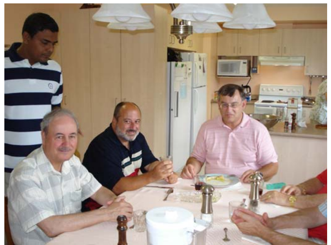
At the central house, Trois-Rivières, in July 2009.