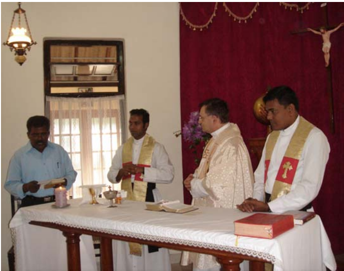
Visit to Sri Lanka, February 2009

It has been my pleasure to serve the Institute as director general. It was an experience for me of faith and of deepening the spirituality of the 5-5-5. I thank you for your confidence and for having supported me with your friendship and your prayers. The love story begin in 1978 when I first became acquainted with the Institute continues now in a different way.