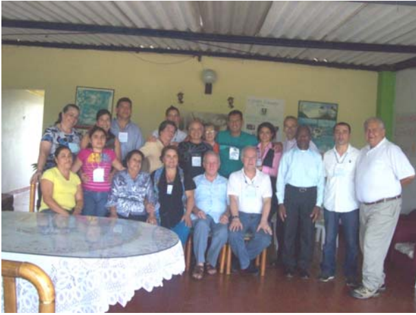
Under the photo there appears almost all of the members of Colombia including two Oblates, two affiliated persons as well as two invitees.

During our meetings, we broach the themes concerning consecrated life, particularly, the spirituality proper to our Institute: the 5-5-5,